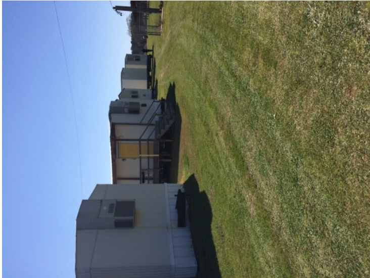
Our additions as of May 2016.

We love that our enrollment is growing, but we had to add two portables to our collection this summer.